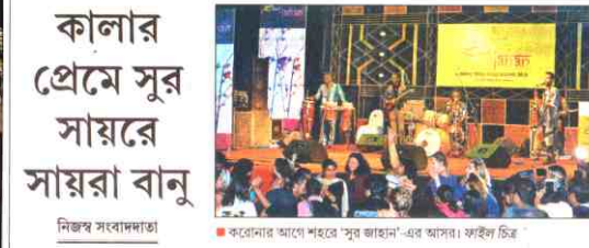
কলকাতার আগে শহুরে 'সুর জাহান'-এর আসর। সফল ছি