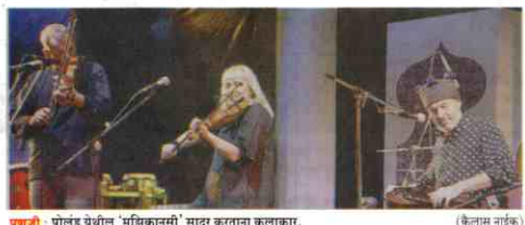
पणजी, पोलंड येथील 'मुझिकानसी' सादर करताना कलाकार.