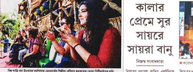
विश्व शांति पत्रा उत्सवचे वर्तमानाचे समारोपके शिबिरात कलाकारांचे प्रेरणा निहाळतारे होव।