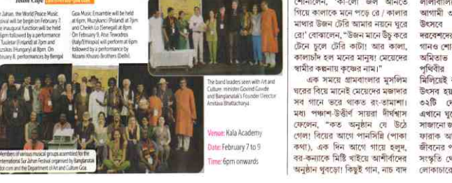
The band leaders seen with AFI and Culture Minister Govind Gaidar (in Bengali) at the inauguration of the World Peace Music Festival.

Sur Jahan, the World Peace Music Festival will be held on February 7. The inaugural festival will be held at Agni Hallway by a performance by 'Sutra' (International Drum and Percussion) and 'Sutra' (International Drum and Percussion) at 8PM. On February 9, Aze Tawabwa (International Drum and Percussion) will perform at 8PM. On February 10, performances by Bengali