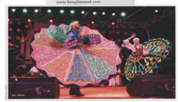
Sur Jahan Kolkata, Goa and Jaipur, India