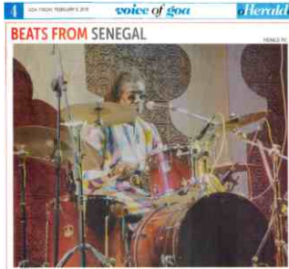
Senegal's Cheikh Lô performs on the second day of the Sur Jahan Musical Festival 2018 at Kala Academy, Campal, Panjim on Thursday.

and Christian background, and whose repertoire includes Nordic and Celtic folk music, to jazz, rock, Klezmer and Middle Eastern ballads; godfather of Nordic music Ale Möller, South Korean band Coreyah and the legendary singer Danyel Waro from the Reunion Island. The Indian contingent will be represented by the Langas of Rajasthan, an ensemble called the Folks of Bengal and a team of Bauls from West Bengal. Other than musical performances, there will be workshops in the day time. Besides, there will be handicrafts on sale where artists from West Bengal and Rajasthan will participate. In Kolkata, the festival will be held in Mohor Kunj on Chowringhee (near Maidan metro railway station), from 6pm to 9pm. No entry fee for musical performance or crafts fair.