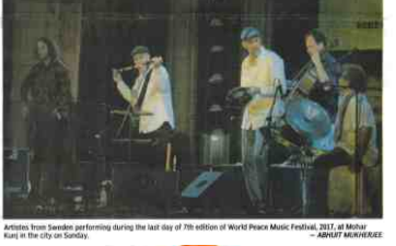
Artists from Sweden performing during the last day of 7th edition of World Peace Music Festival, 2017, at Mohar Kunj in the city on Sunday.