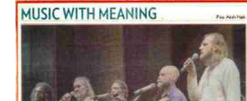
Artists performing during the 'Sur Jahan' music festival