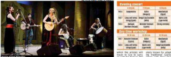
Actress Anna Sundara performing during the last day of 10th edition of World Peace Music Festival, 2017, at Mohor Park in the city on Sunday.

International musiciansto maketheirwaytoGoa The 10th edition of the World Peace Music Festival (WPMF) is set to kick off in Goa on Friday, February 3, 2017. The festival, which is a platform for international musicians to showcase their talents, will feature a variety of acts including rock, jazz, and traditional music. The festival is organized by the World Peace Music Foundation, which aims to promote peace and unity through music. The festival will be held at the Mohor Park in Goa. The festival is expected to attract a large number of tourists and music lovers from all over the world.