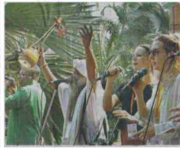
Performers of South of America from India

पाश्चात्य संगीताचा -मिलाफ गोमंतकीय संगीत प्रकार मिश्टगार आहे. मंडोलीना, अँकोडीयन, शॉन, काव्हॉर्न, हेडगार्डी, डोल, इत्यादी विविध वाद्येना वर संगीत प्रस्तुत करणारे