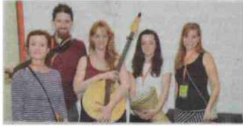
संगीत महोत्सवात भाग घेणारे विदेशी कलाकार.