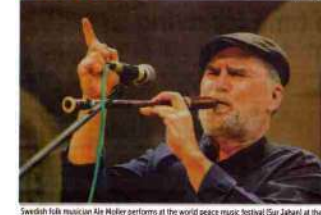
Artists performing during the 'Sur Jahan' music festival