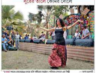
Actress Anna Sundara performing during the last day of 10th edition of World Peace Music Festival, 2017, at Mohor Park in the city on Sunday.