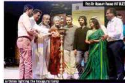
Artists lighting the inaugural lamp