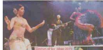
Clashes of Sur Jahan 2019