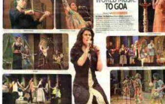
Artists performing during the 'Sur Jahan' music festival