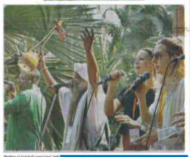
The Navhind Times